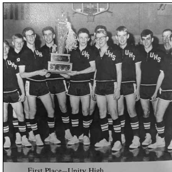
First Place—Unity High